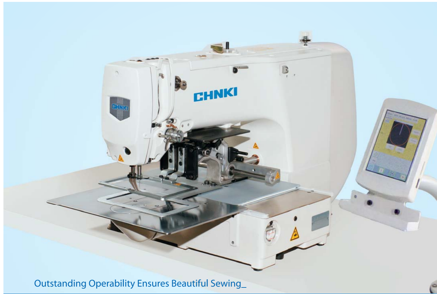
Outstanding Operability Ensures Beautiful Sewing_

COMPUTER-CONTROLLED PROGRAMMABLE MACHINE WITH INPUT FUNCTION