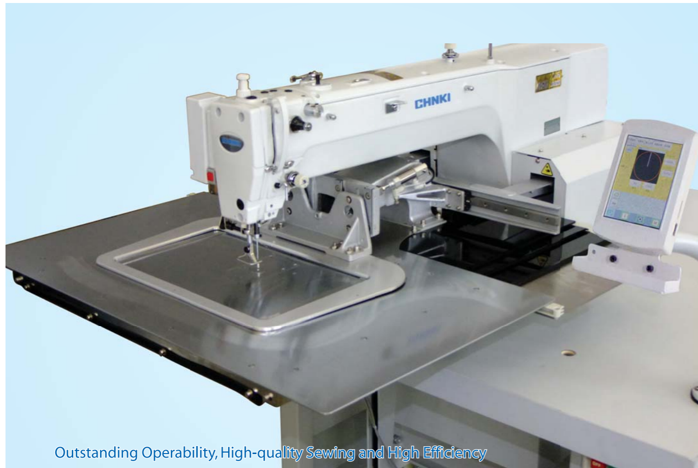
Outstanding Operability, High-quality Sewing and High Efficiency

COMPUTER-CONTROLLED PROGRAMMABLE MACHINE WITH INPUT FUNCTION