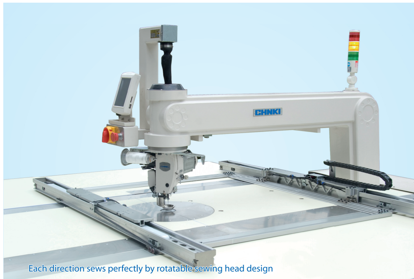
Each direction sews perfectly by rotatable sewing head design

PERFECT STITCH PROGRAMMABLE PATTERN TEMPLATE SEWING MACHINE